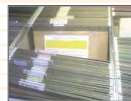
Decals stored in File Folders

Making the best use of the vertical space in the hangar, the VLMs from White stand 32 feet high, each holding up to 113 trays. The trays can be configured to hold up to 180 individual parts with a total live load of up to 550 pounds.