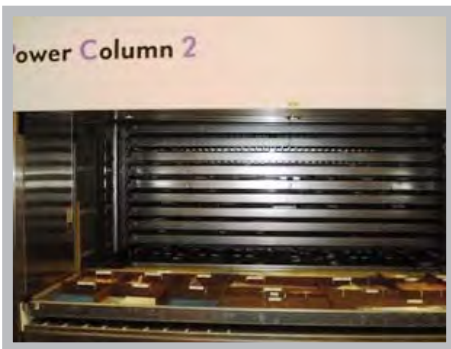
Various size items

Improved inventory control and created more space.