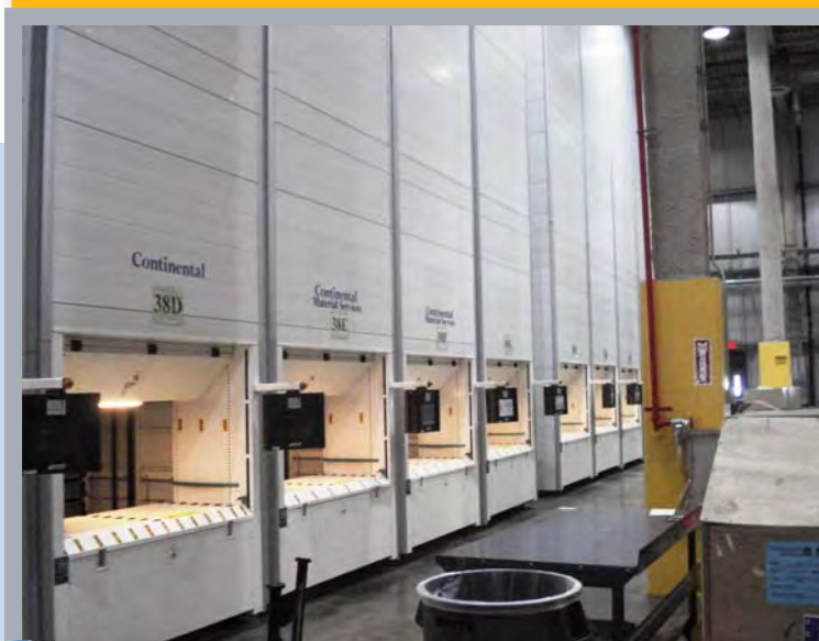
Savings in time, space and a cleaner, more secure parts inventory are among the benefits of using VLMs over static shelving.

Vertical Lift Modules secure time critical parts, yield 97% space savings.